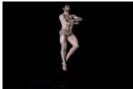
In Slow Motion