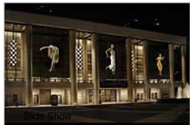
Behind the Scenes of 'Slow Dancing'